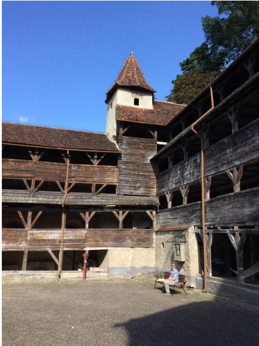
The impressive jute craft fortification in Brasov