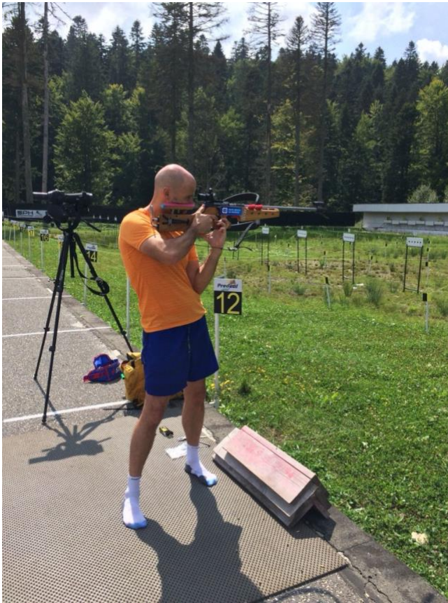
Predeal biathlon range, nice setting!

only try our best. Needless to say, shooting tiny biathlon targets at a range of 50 m is not like watching Fourcade on TV and was a lot more difficult than it seems. Yes, they are minute and we left a lot of bullets in the surrounding forest trees.