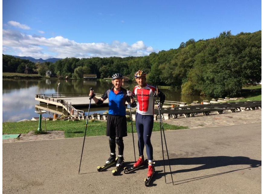
In the Astra Ethnic Museum in 2017

For some the name Transylvania might evoke the famous vampire we are obviously not going to mention, but the place is a real treasure for those who want to experience some excellent rollerskiing in a beautiful setting.