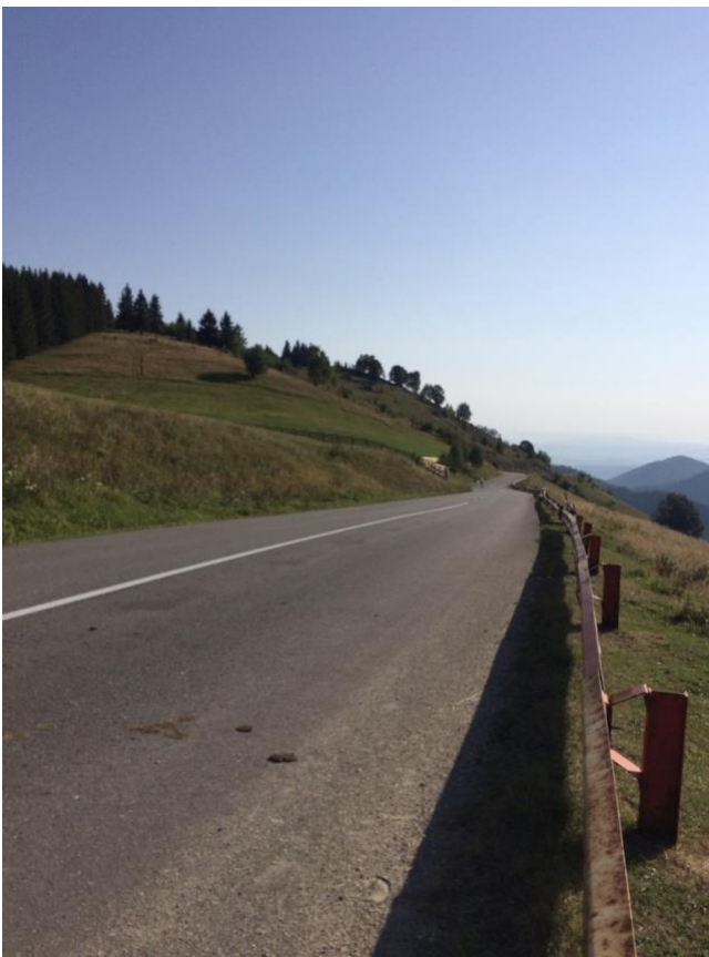
Reaching the top of 10km of solid climb

Afterwards we did some agility work around the rose garden in the park, the rose thorns giving us encouragement to make the corners.